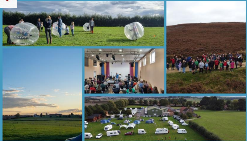
ALL SAINTS' CHURCH CAMP FRI 7 - SUN 9 JULY